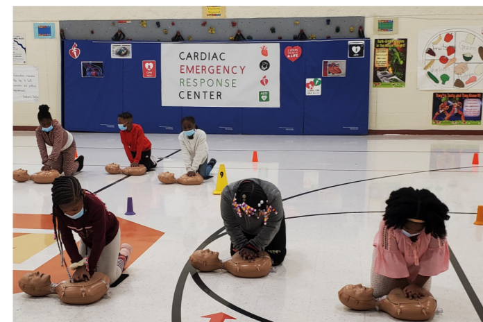
Students participate in CPR training in Ms. Burlison-Longino's physical education class.

1843 STANWOOD ROAD EAST CLEVELAND, OHIO 44112 216-268-6600 WWW.EASTCLEVELANDSCHOOLS.ORG